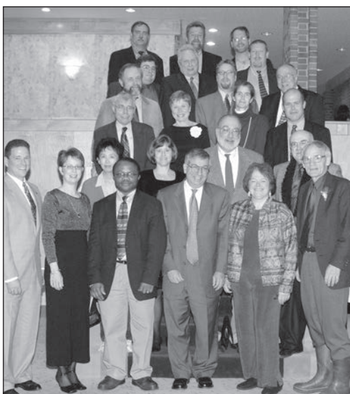
Madison faculty and staff