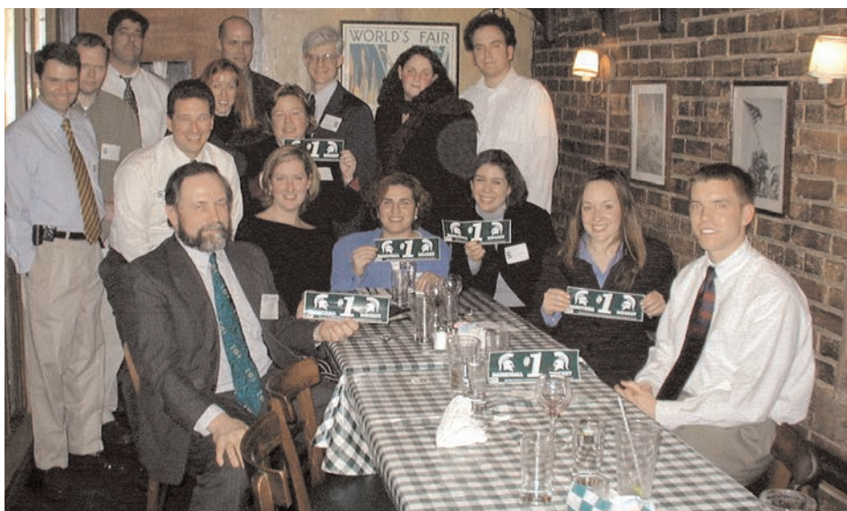
Chicago area Madison alumni, faculty, and staff met over dinner at P.J. Clark's on February 22, 2001.