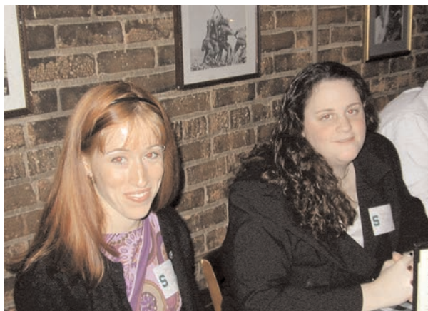
Chicago area Madison alumni at dinner on February 22, 2001.