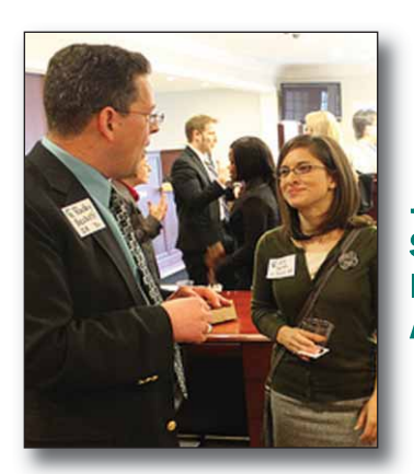
JMC Student Senate Career Exploration/Detroit, April 2013