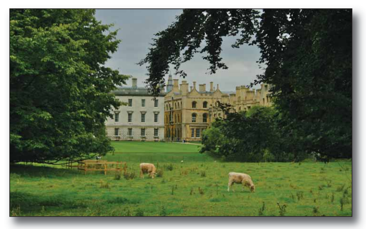
Second Place: "Where Time Stands Still" - Mercedes Alonzo