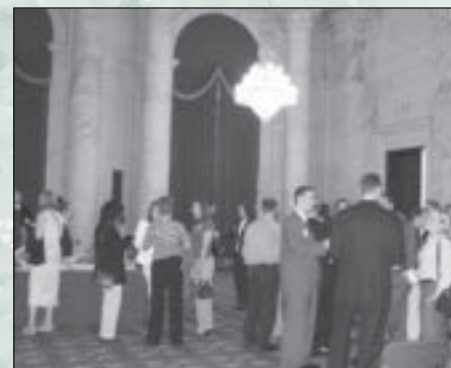
Washington, D.C. Alumni and Friends Reception, May 2004