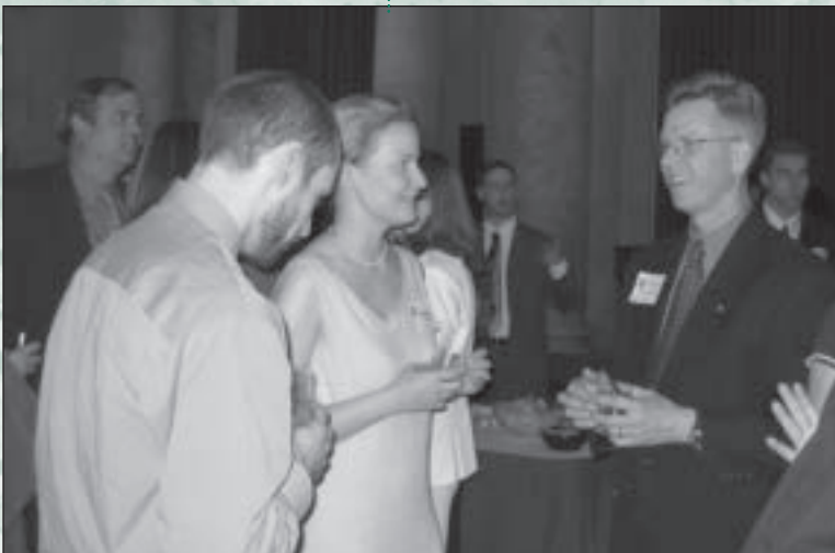
Washington, D.C. Alumni and Friends Reception, May 2004