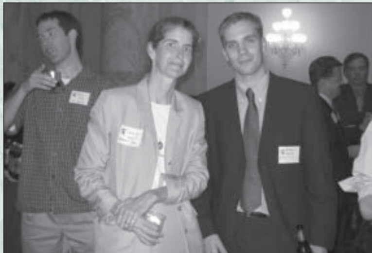
Washington, D.C. Alumni and Friends Reception, May 2004