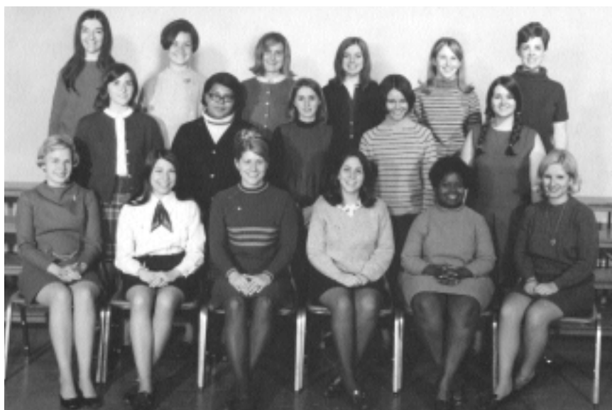
Women of the first Madison graduating class