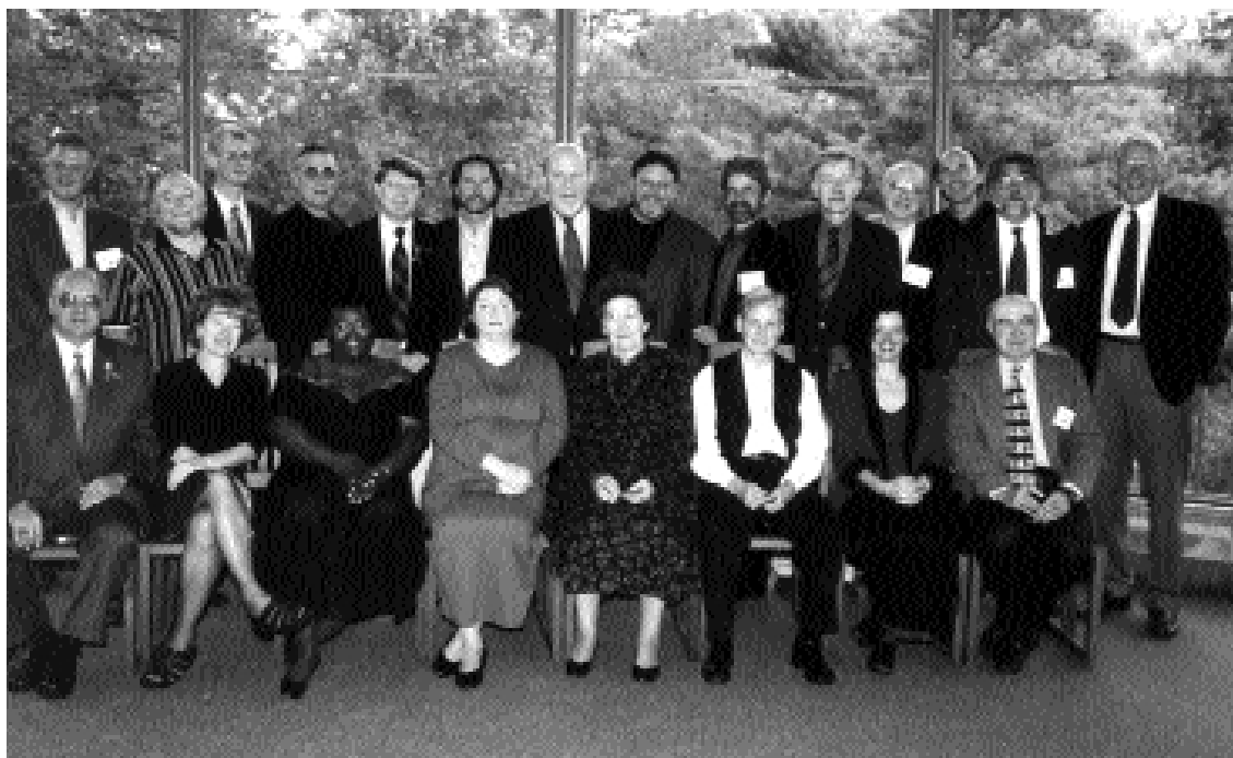
Members of the first Madison class and faculty at the 30th reunion dinner, September 22, 2001.