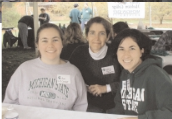
Madison tailgate brunch, MSU Homecoming, October 13