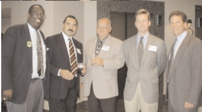
Madison alumni and faculty met in Novi, Michigan on September 5 for the annual Detroit area alumni reception.