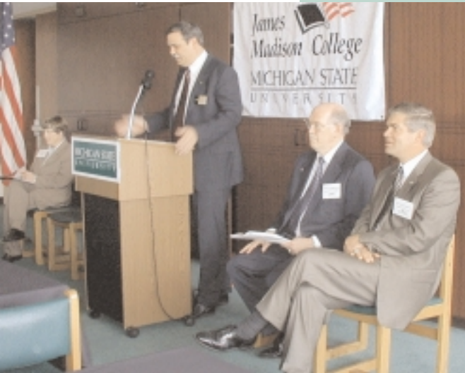
The JMC library was dedicated on September 21, 2001.