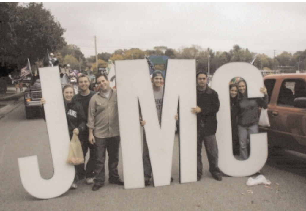
Madison students in the MSU Homecoming Parade